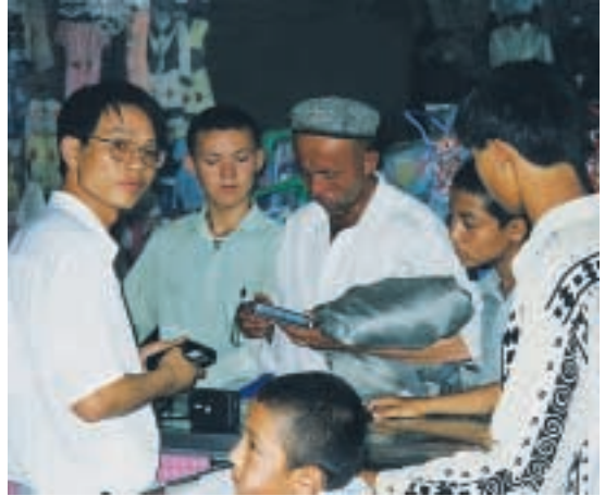
Shoppers in Xinjiang, China, examine radios.

If you just want to hear the major stations, you'll do fine with a moderately priced portable. Beyond that, portatop models have a better chance of bringing in faint and difficult signals, and they usually