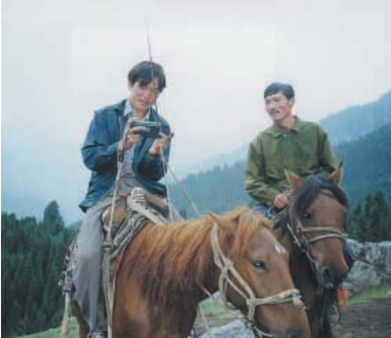
Chinese cowboys listen to foreign broadcasts on their Tecsun world band radios.

them, so sometimes they try to outshout each other.