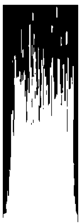
Here is a typical digital channel, this is channel 68 occupying 839.25MHz to 845.25MHz

A typical analogue channel, this one was Channel 4 at 823.25MHz with a sound carrier (right) at 829.25MHz