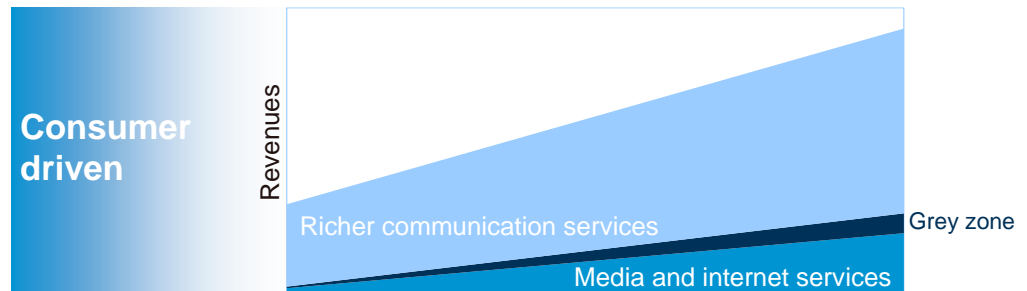
Figure 1: Consumer driven trends to increase revenues.