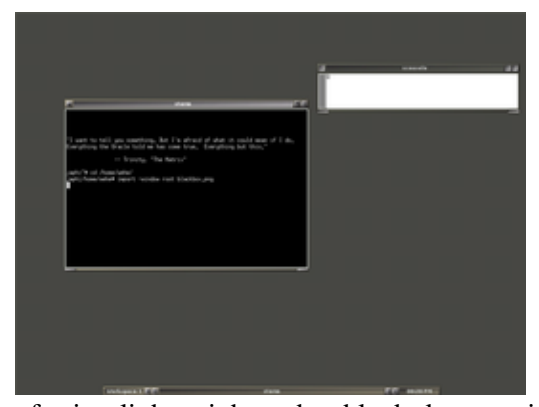
Figure E-1. Screenshot of blackbox.

5. <u>xfce</u> is a lightweight and stable desktop environment for various UNIX systems.