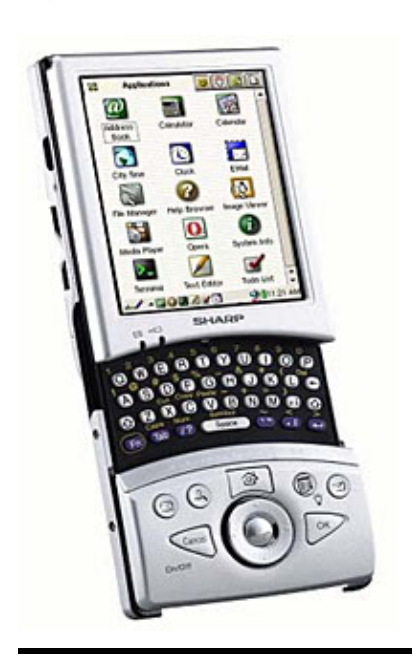
Figure 6-2. Screenshot of the SHARP Zaurus SL-5500 PDA.

The SHARP Zaurus SL-5000/5500 wasn't the first Linux PDA, but the one with the greatest success in the Linux community and beyond.