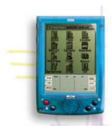
Figure 7-1. Screenshot of the HELIO PDA.